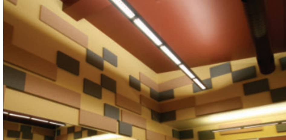
Left: State-of-the-art movement studios in the new Handel Center feature special slip-resistant, cushion-backed flooring to reduce injuries and sound-proofing panels on the walls to isolate noise.