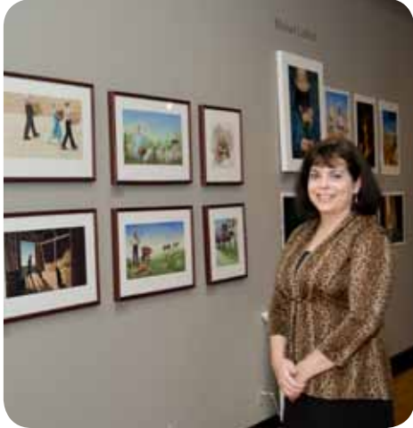
Student at her Thesis Exhibit