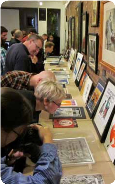
Critique at Society of Illustrators in New York City

Students should assume additional expenses for transportation to and from contact period locations, hotels, meals, art supplies and car rentals.