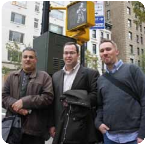
Students in New York City during Contact Period

Our MFA in Illustration program has brought together some of the best illustrators from around the country to push and challenge their students to be the best they can be. The program offers the best in overall quality and flexibility for working illustrators. I never could have obtained my MFA if it weren't for this program... and what a program!