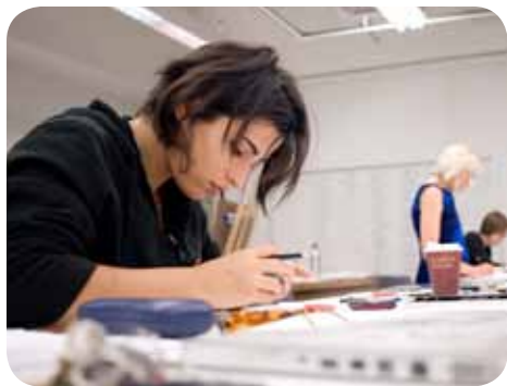
Student working on her assignment in class