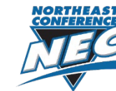
Northeast Conference (NEC) - FY 2019 Sports Sponsored