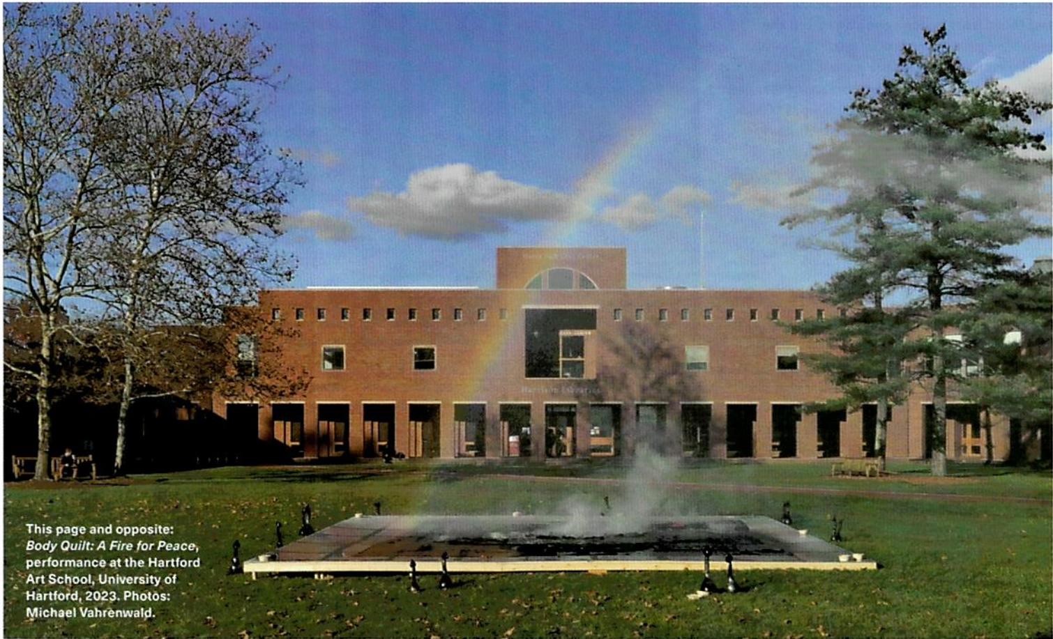
This page and opposite: Body Quilt: A Fire for Peace, performance at the Hartford Art School, University of Hartford, 2023.