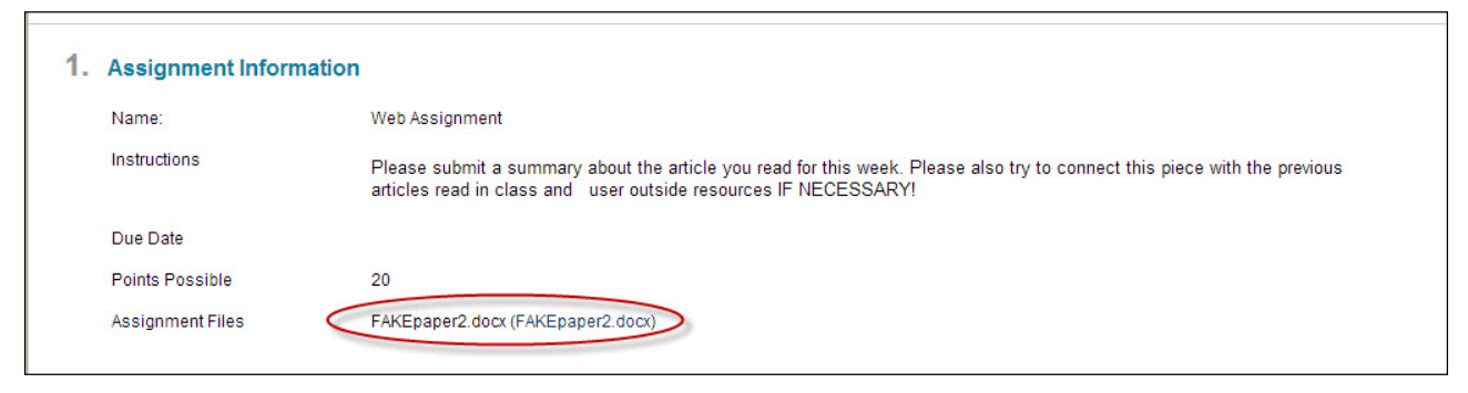
Selecting the link to download the file

• If your instructor attached files related to the assignment, click on the file name to download and save it to your computer (see below).