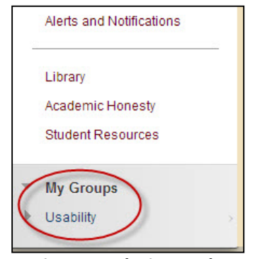
Accessing your designated group

The instructor typically sets up groups. If your instructor has assigned groups, you will see your groups in a box underneath the course menu. You can only enter groups in which you are a member.