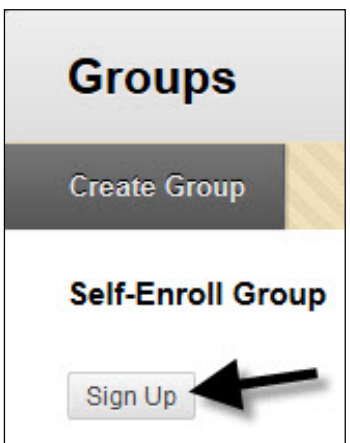
Signing up for Self-Enroll Groups

Sometimes, groups are set up so that students can choose which group they want to join. To join, look for a signup button under the heading "Self-Enroll Group". The signup button name may vary from course to course.