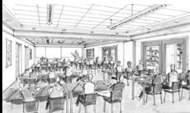
Proposed seminar space in the new Greenberg Center facility.