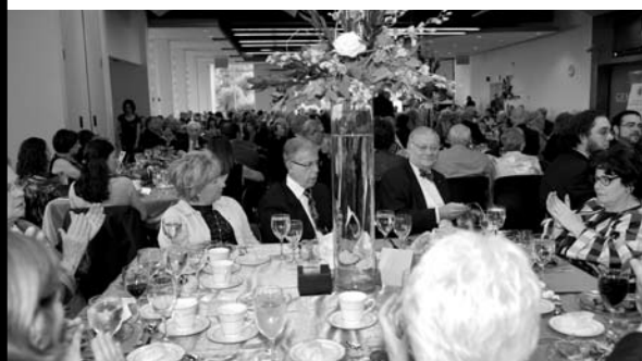
The elegant banquet that marked the Greenberg Center's 25th anniversary welcomed 360 guests on Sept. 25, 2011.