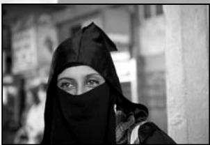
Veiled Woman, Jerusalem