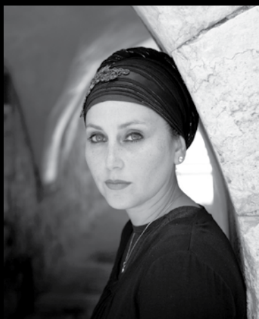
From Veiled Women exhibition

Registration required by Monday, January 30: 860.768.4964 or mgcjs@hartford.edu . Fee: $40 (CEUs awarded; scholarships available)